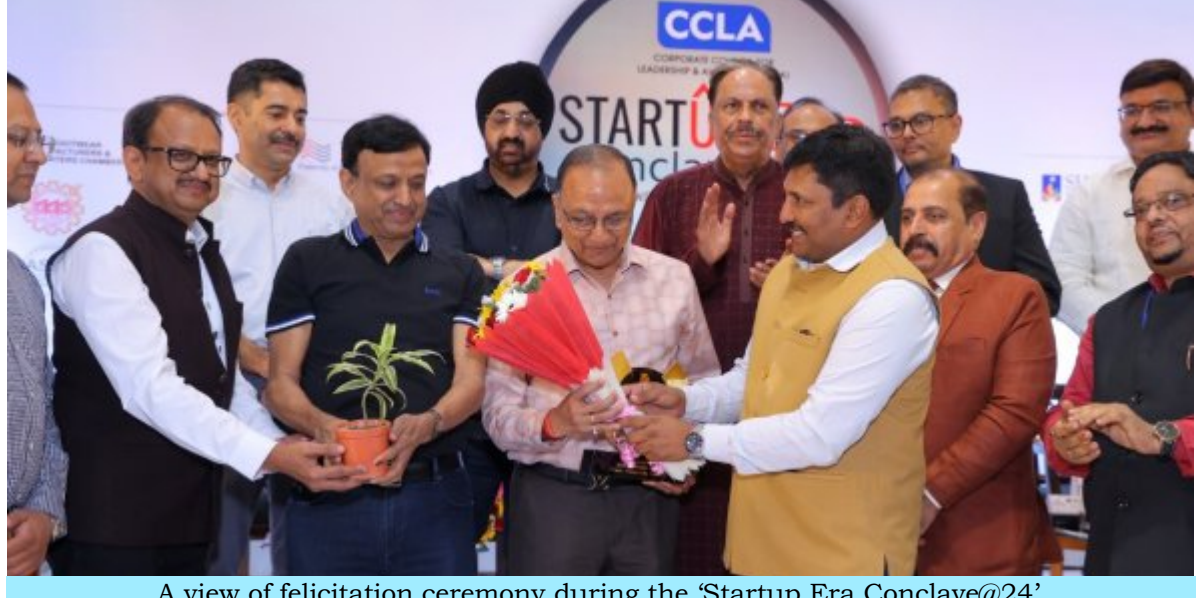
A view of felicitation ceremony during the 'Startup Era Conclave@24'

national organization which is working for corporate community organized this Startup Era Conclave@24: Igniting Innovation and Fostering Collaboration, where visionaries united to shape the future of technology and entrepreneurship.