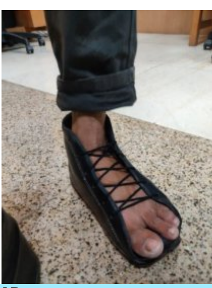
Root cause analysis for individual with LLD

utilization, and impact of technology-enhanced footwear designed specifically for individuals with Limb Length Discrepancy (LLD).